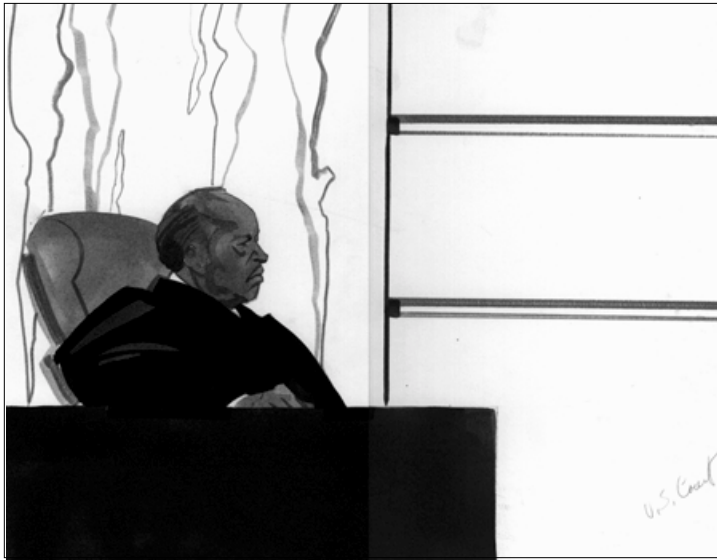
A federal judge presiding over a trial

The Constitution includes both of these protections—life tenure and unreduced salary—so that federal judges will not fear losing their jobs or having their pay cut if they make an unpopular decision. Sometimes the courts decide that a law that has been passed by Congress and signed by the President, or a law that has been passed by a state, violates the Constitution and should not be enforced. For example, the Supreme Court's decision in Brown v. Board of Education in 1954 declared racial segregation in public schools to be unconstitutional. This decision was not popular with large segments of society when it was handed down. Some members of Congress even wanted to replace the judges who