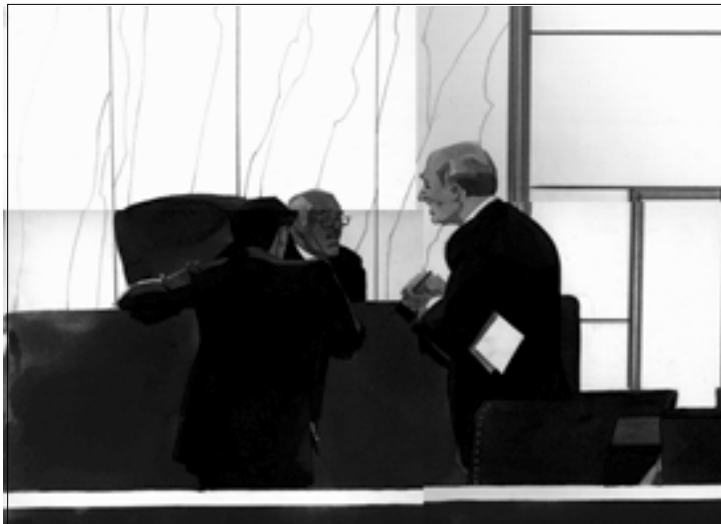
Attorneys meet the judge at the bench for a sidebar

Closing arguments and instructions. After the evidence has been presented, the lawyers make their closing arguments to the jury, concluding the presentation of their cases. Like the opening statements, the closing arguments don't present evidence but summarize the most important features of each side's case. Following the closing arguments, the judge gives instructions to the jury, explaining the relevant law, how