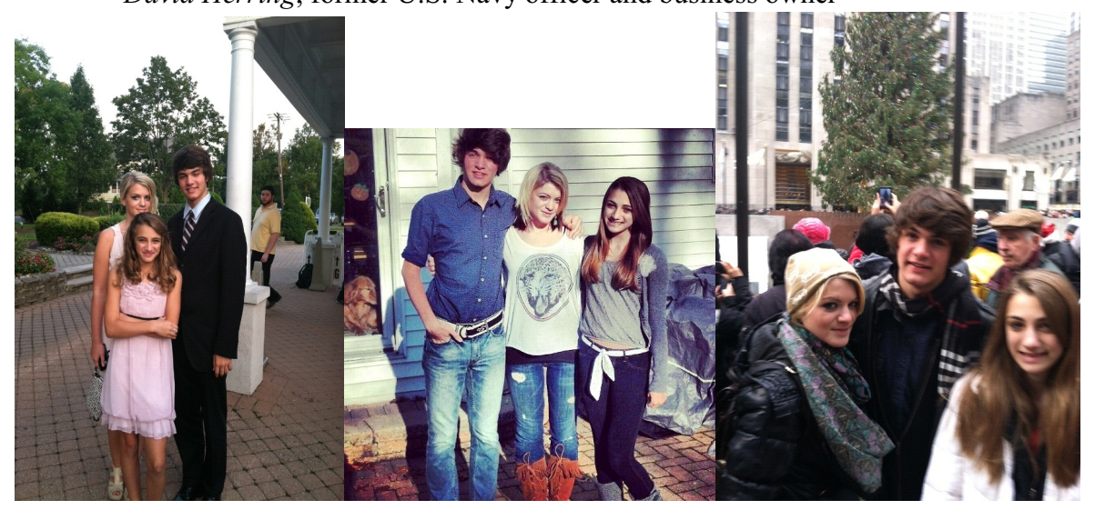
Markus & Markus Pllc • 40 N.W. Third Street • Penthouse One • Miami, Florida 33128